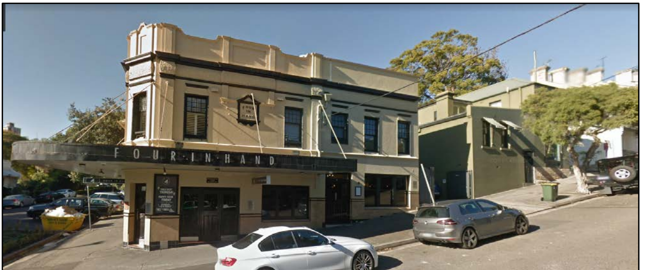
Figure 4: Image of the adjoining residential properties to the east along Sutherland Street