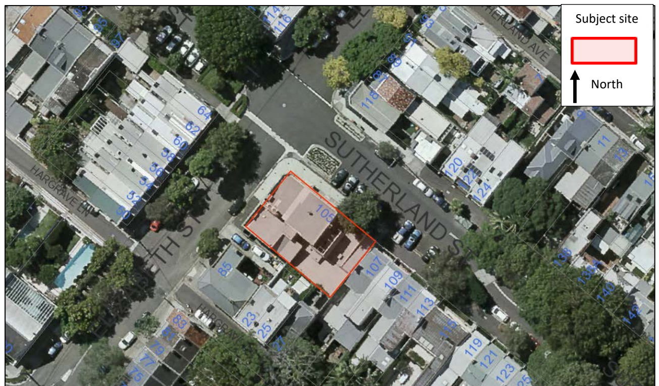
Figure 2: Cadastral map showing the Four In Hand Hotel site outlined in red